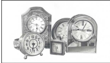
Georgia Bacon Tempus Fugit (Time Flies) (Tamworth Regional Gallery)